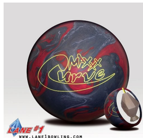
Coming soon .. Maxx Curve